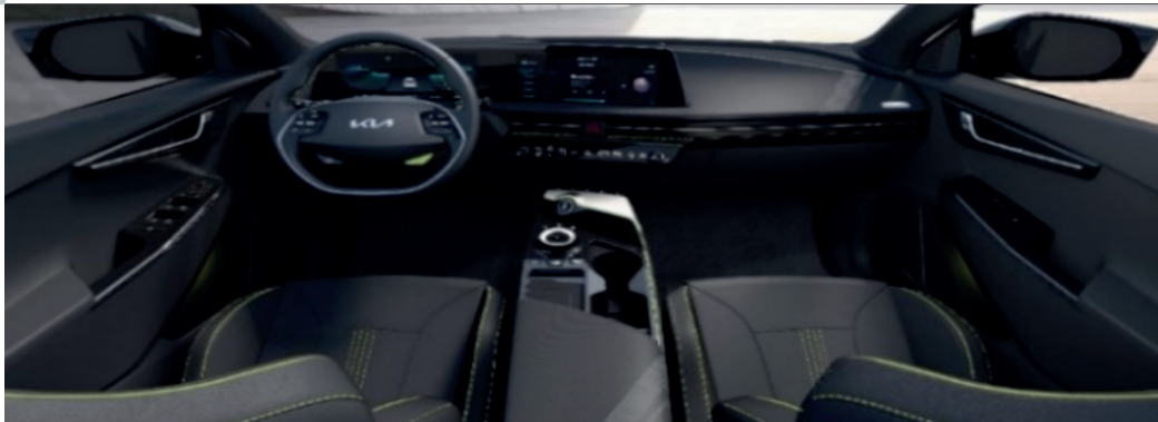
Black Suede with Neon Green Stitching