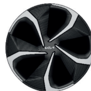
21 Alloy Wheels